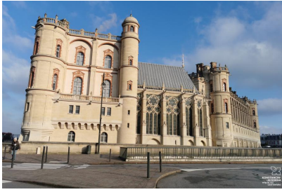
Château de Saint-Germain-en-Laye - the former royal palace.