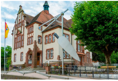
Denzlingen town hall building.